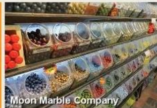
Moon Marble Company