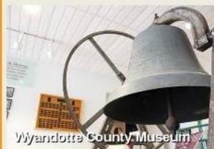
Wyandotte County Museum