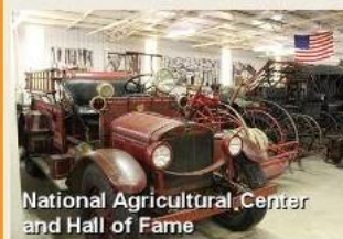
National Agricultural Center and Hall of Fame