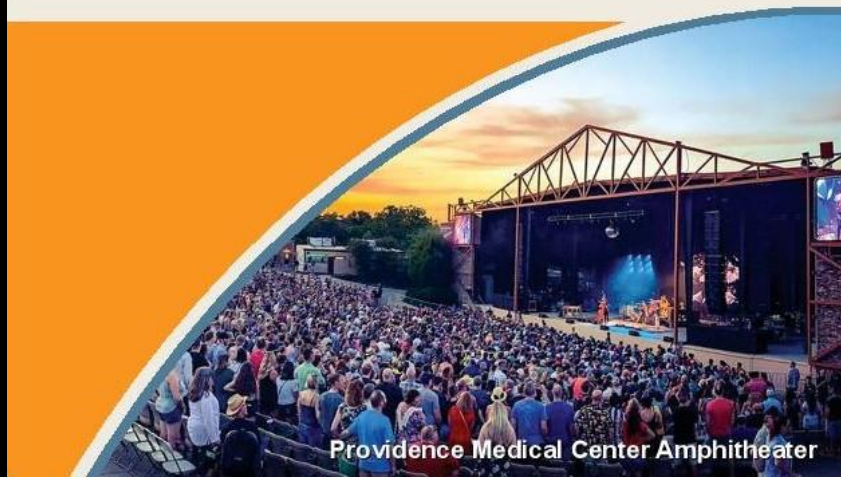
Providence Medical Center Amphitheater