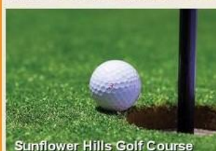
Sunflower Hills Golf Course