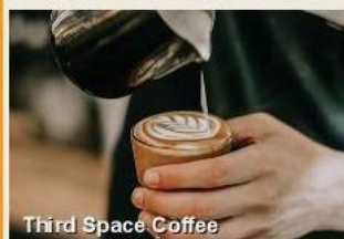
Third Space Coffee