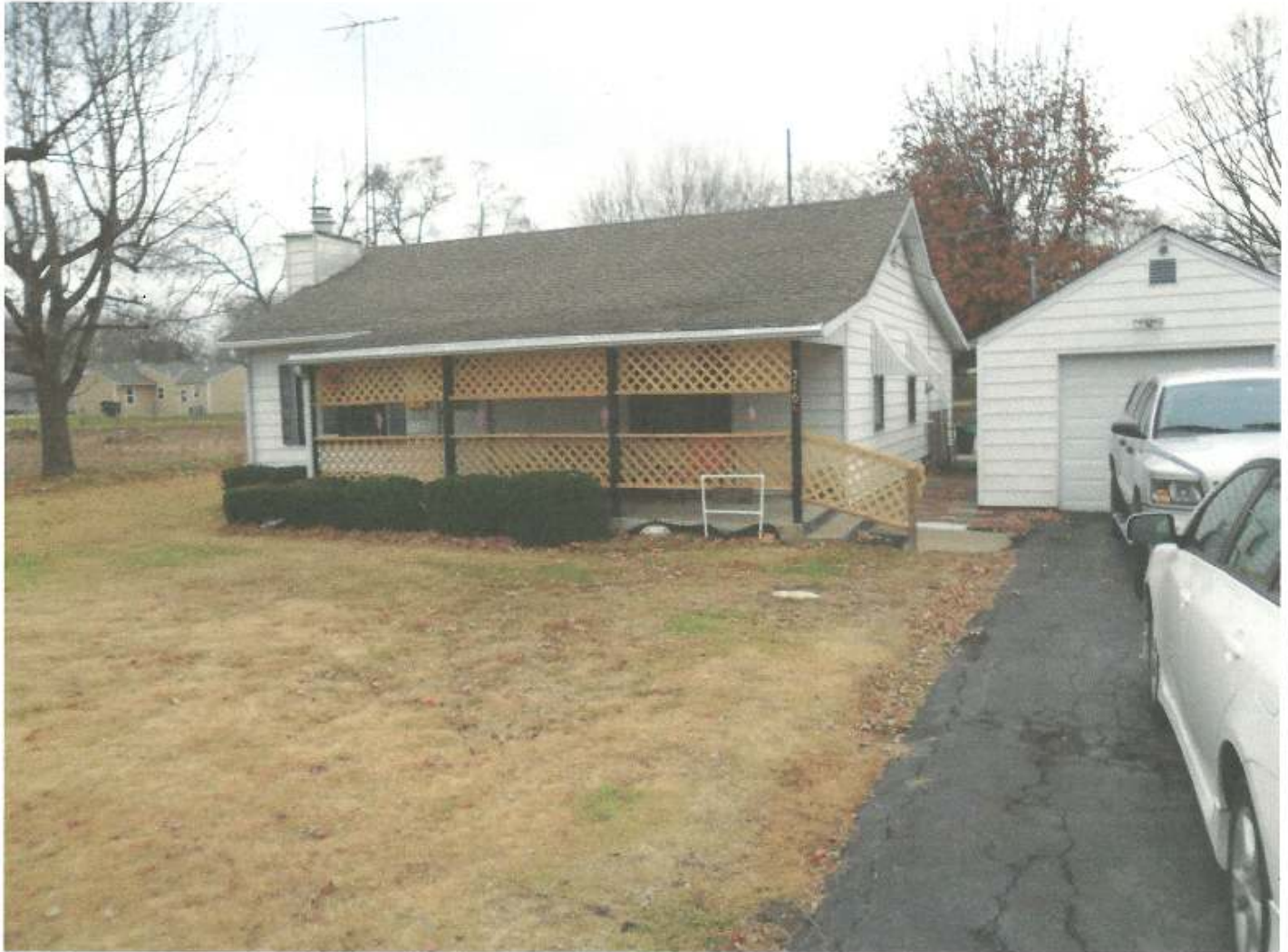
Front View (north) 11/22/2013

If using the Elevation Certificate to obtain NFIP flood insurance, affix at least 2 building photographs below according to the instructions for Item A6. Identify all photographs with date taken; "Front View" and "Rear View"; and, if required, "Right Side View" and "Left Side View." When applicable, photographs must show the foundation with representative examples of the flood openings or vents, as indicated in Section A8. If submitting more photographs than will fit on this page, use the Continuation Page.