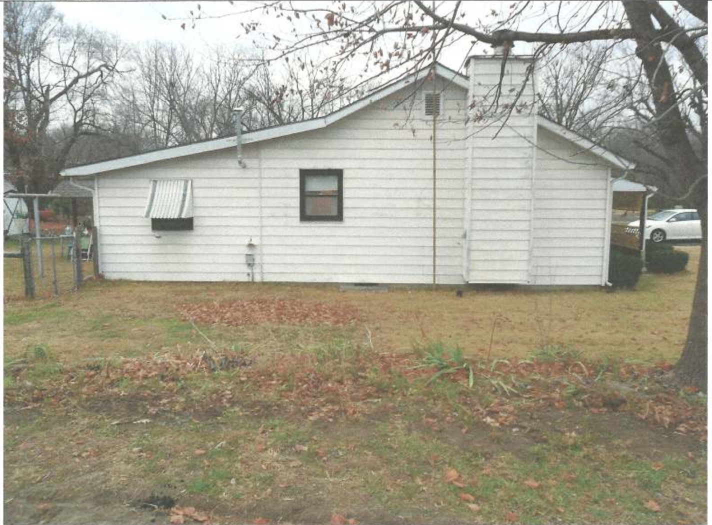
Left Side View (east) 11/22/2013

If submitting more photographs than will fit on the preceding page, affix the additional photographs below. Identify all photographs with: date taken; "Front View" and "Rear View"; and, if required, "Right Side View" and "Left Side View." When applicable, photographs must show the foundation with representative examples of the flood openings or vents, as indicated in Section A8.