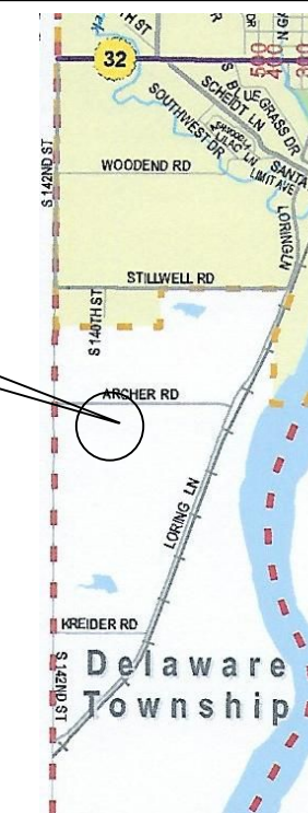
LOCATION MAP NO SCALE